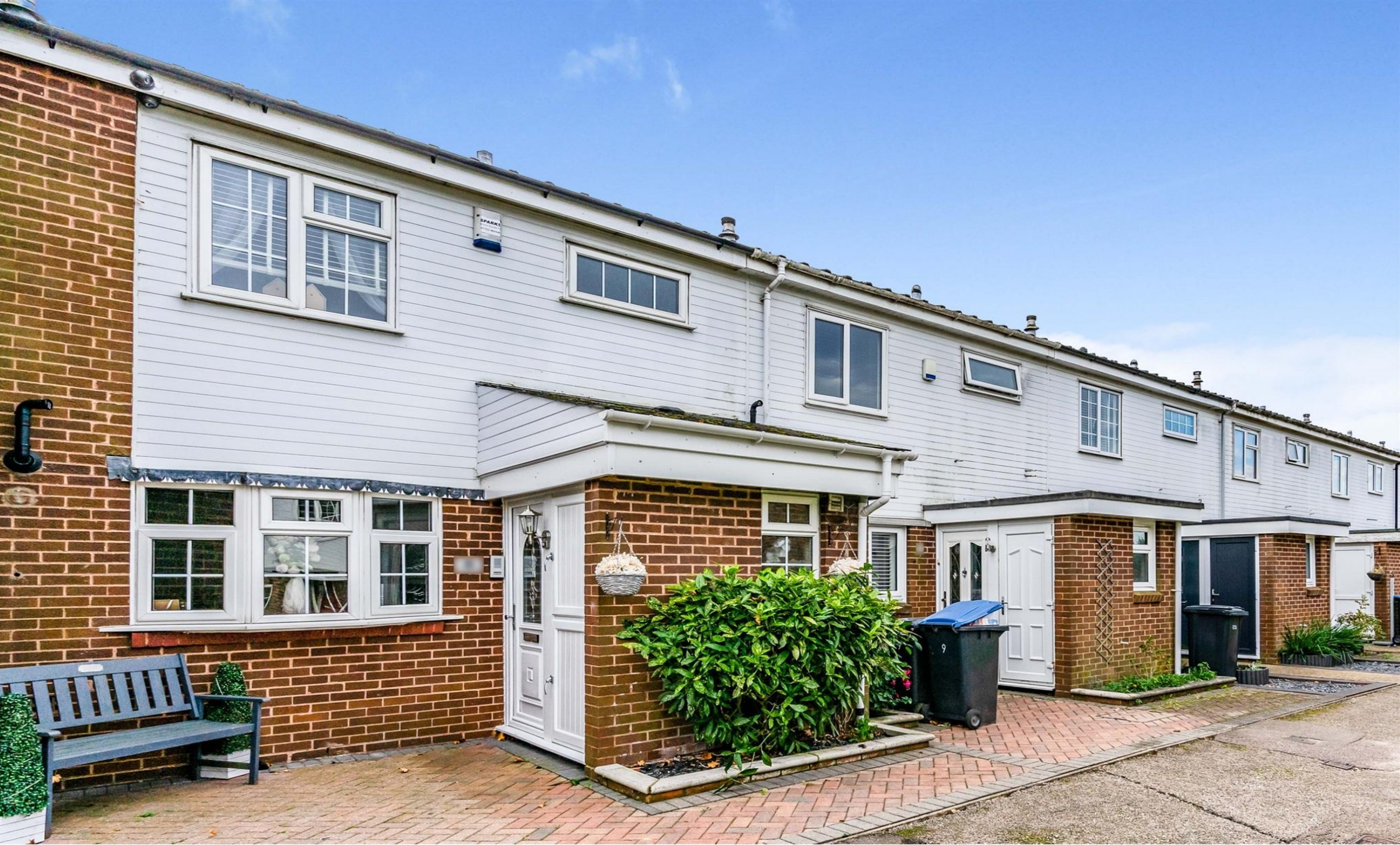
Sycamore Field, Harlow CM19 5RT