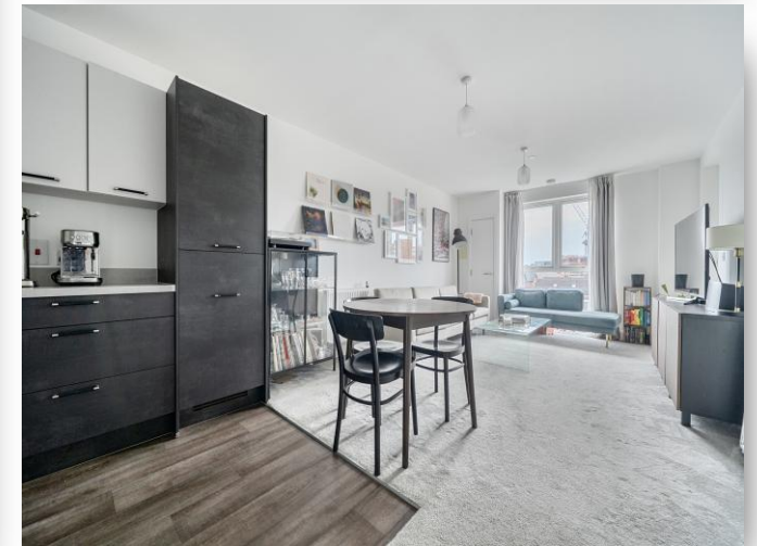
Flat 63 Trinity Place, Park Street, Maidenhead SL6 1TJ