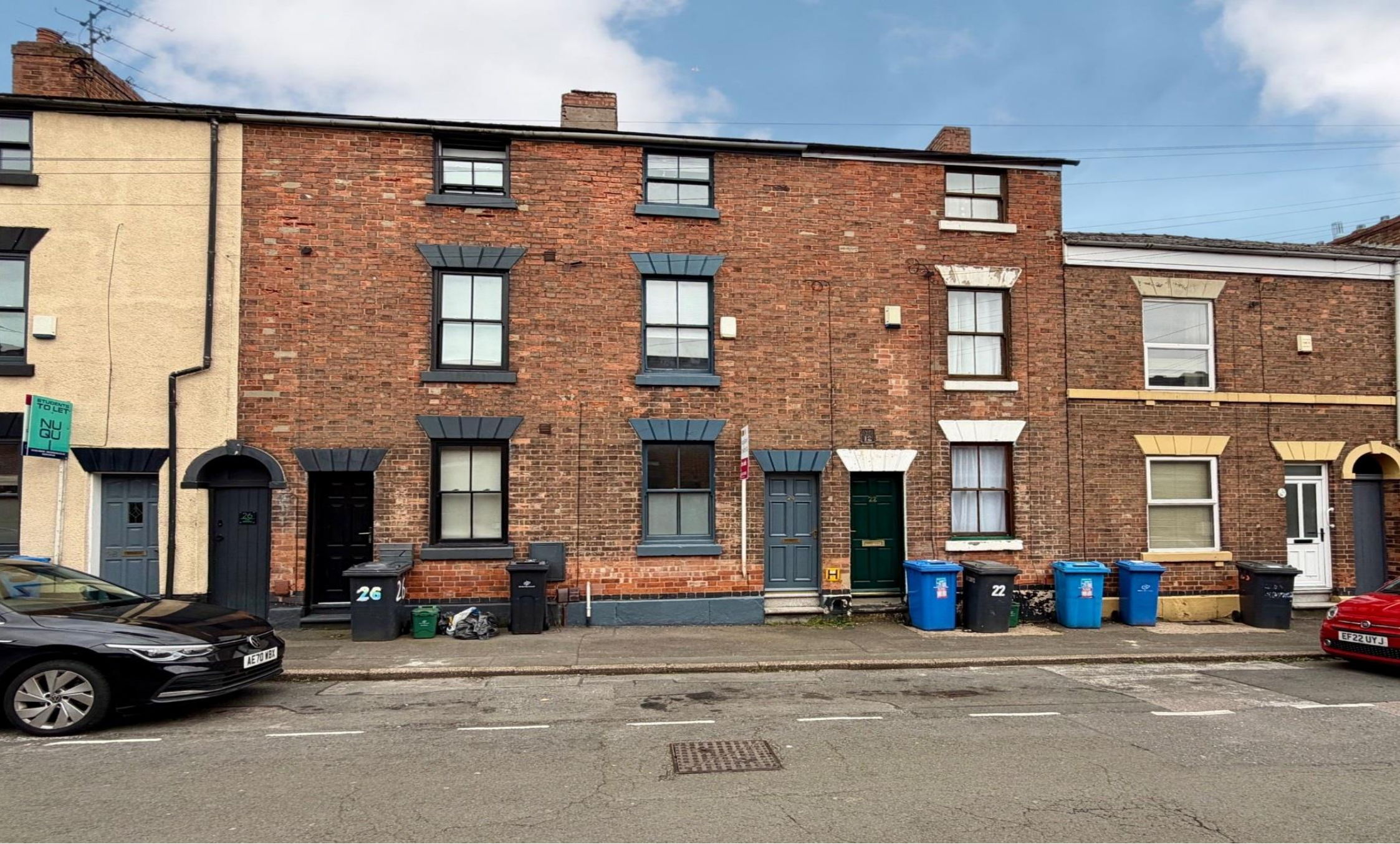
Arthur Street, Derby, DE1 3EF