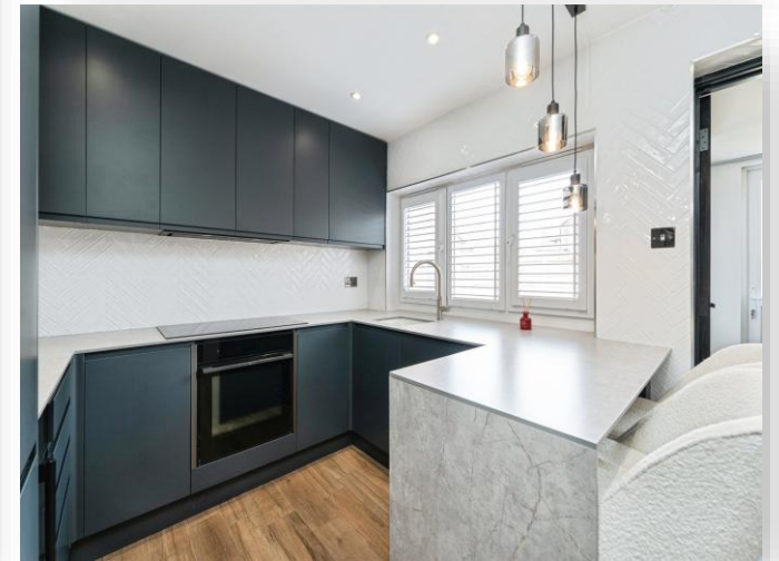
Oak Drive, Beck Row IP28 8UA