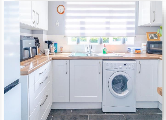
Barbury Court, Giffard Park, MILTON KEYNES, MK14 5PT