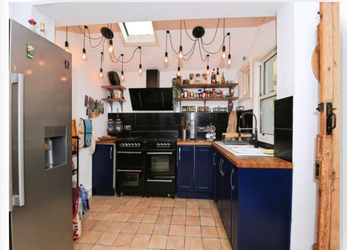
Broadway, Peterborough PE1 4DG