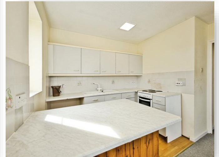
Beaulieu Drive, Yeovil, BA21 3TP