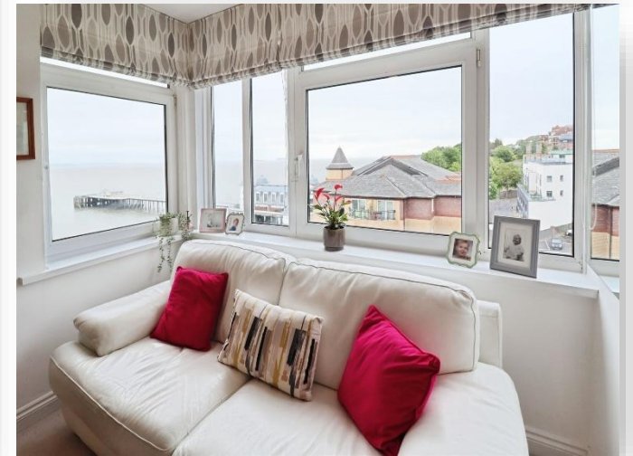
Sea Bank, Penarth, CF64 3AR