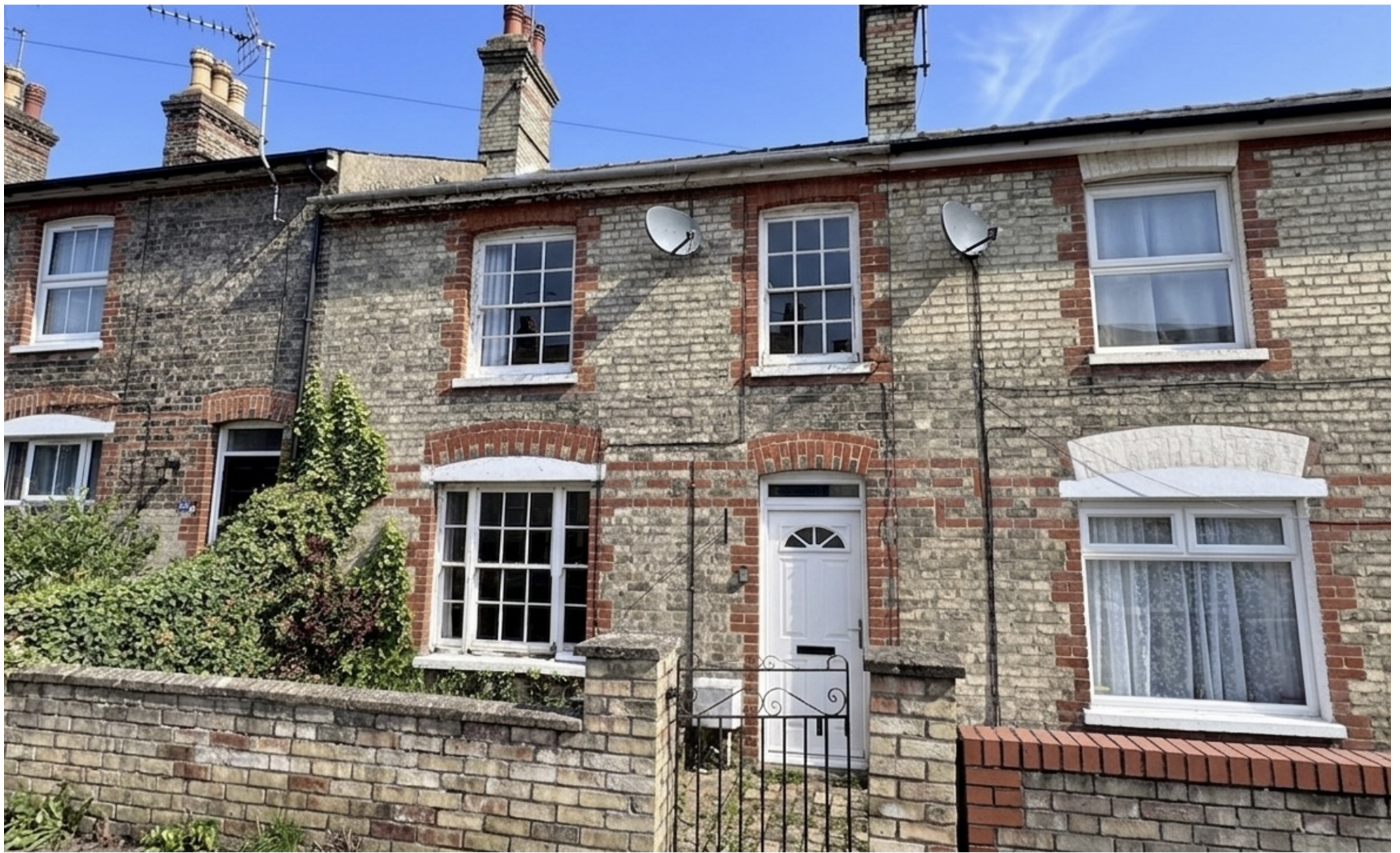
Exeter Road, Newmarket, Suffolk