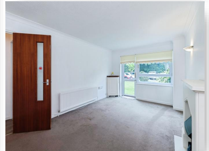
Homeleigh House Wellington Road, Bournemouth BH8 8LF