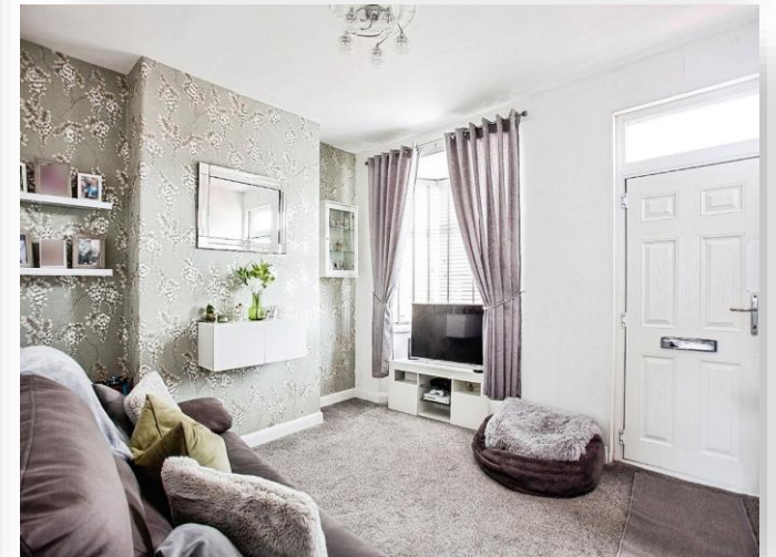
Crossland Street, Swinton Mexborough S64 8BB