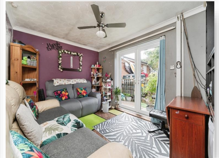
Woodcutters Way, Lakenheath, Brandon, IP27 9JQ