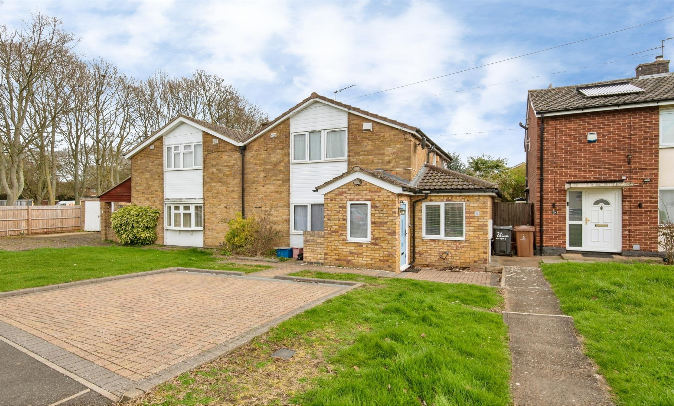
Bedwell Crescent, STEVENAGE SG1 1LT