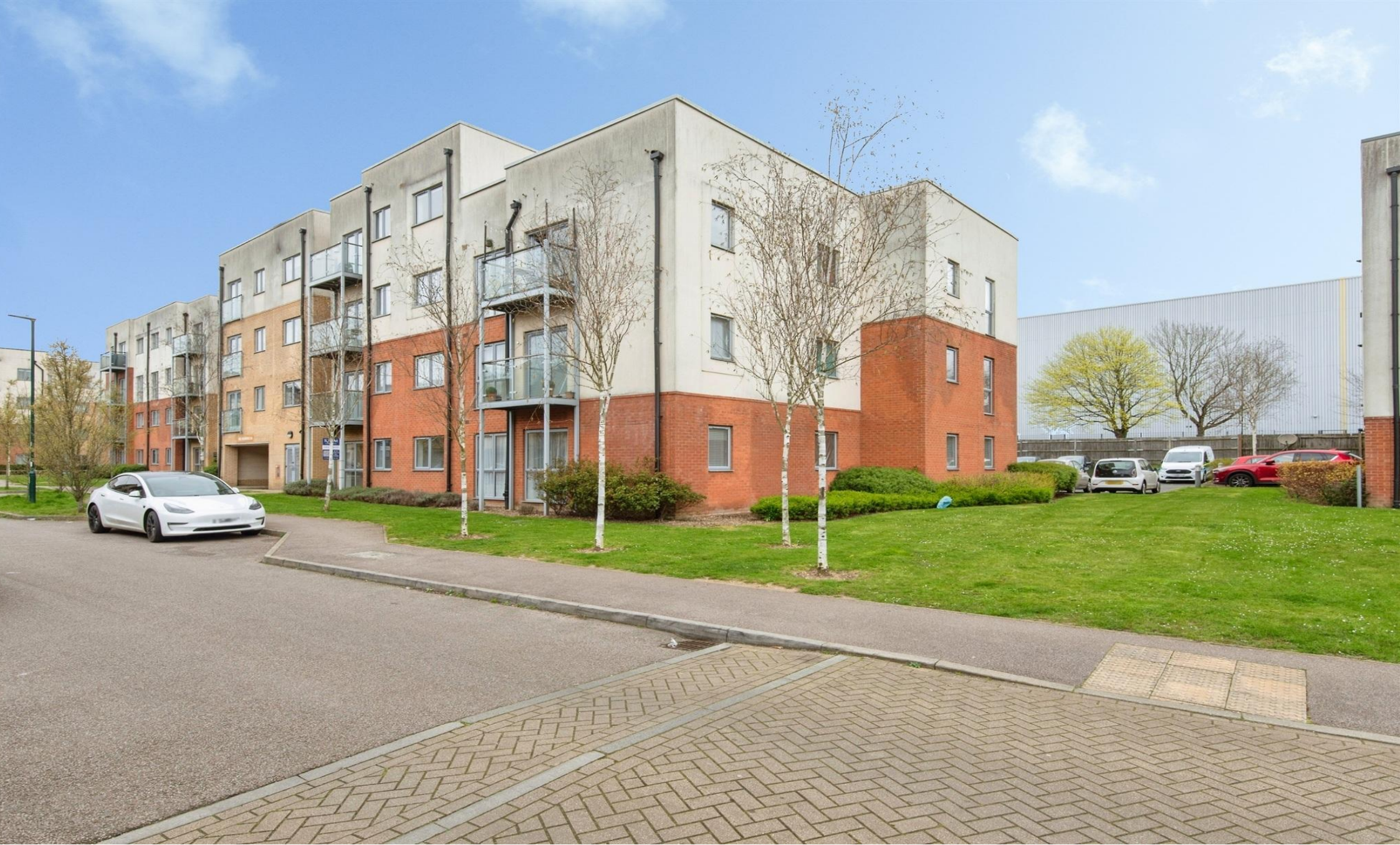
Papillion Court Admiral Drive, Stevenage SG1 4GL