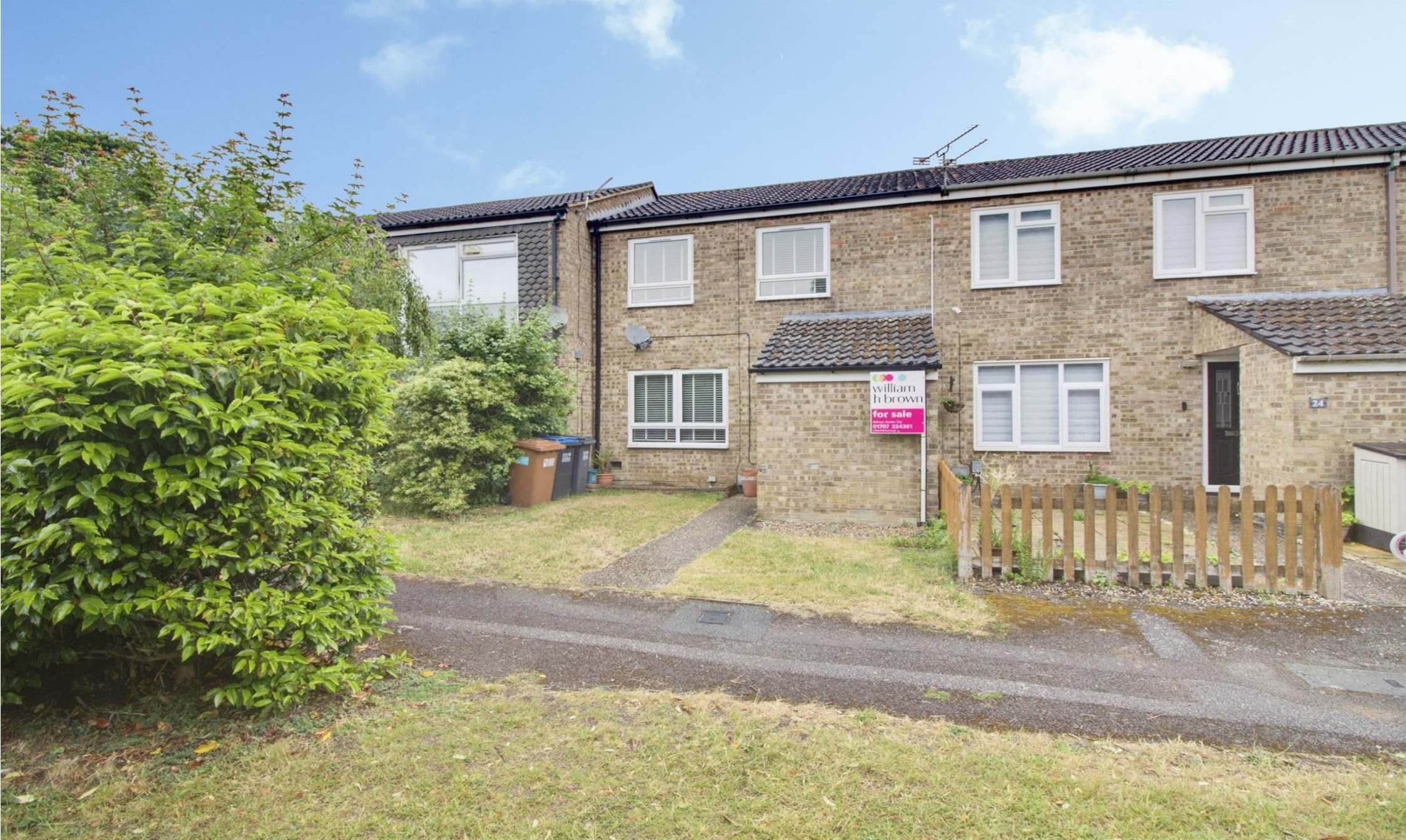
Baldwins, WELWYN GARDEN CITY AL7 2BD