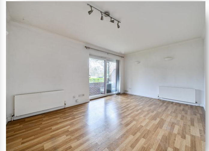
1 Woodhurst North, Ray Mead Road, Maidenhead SL6 8PH