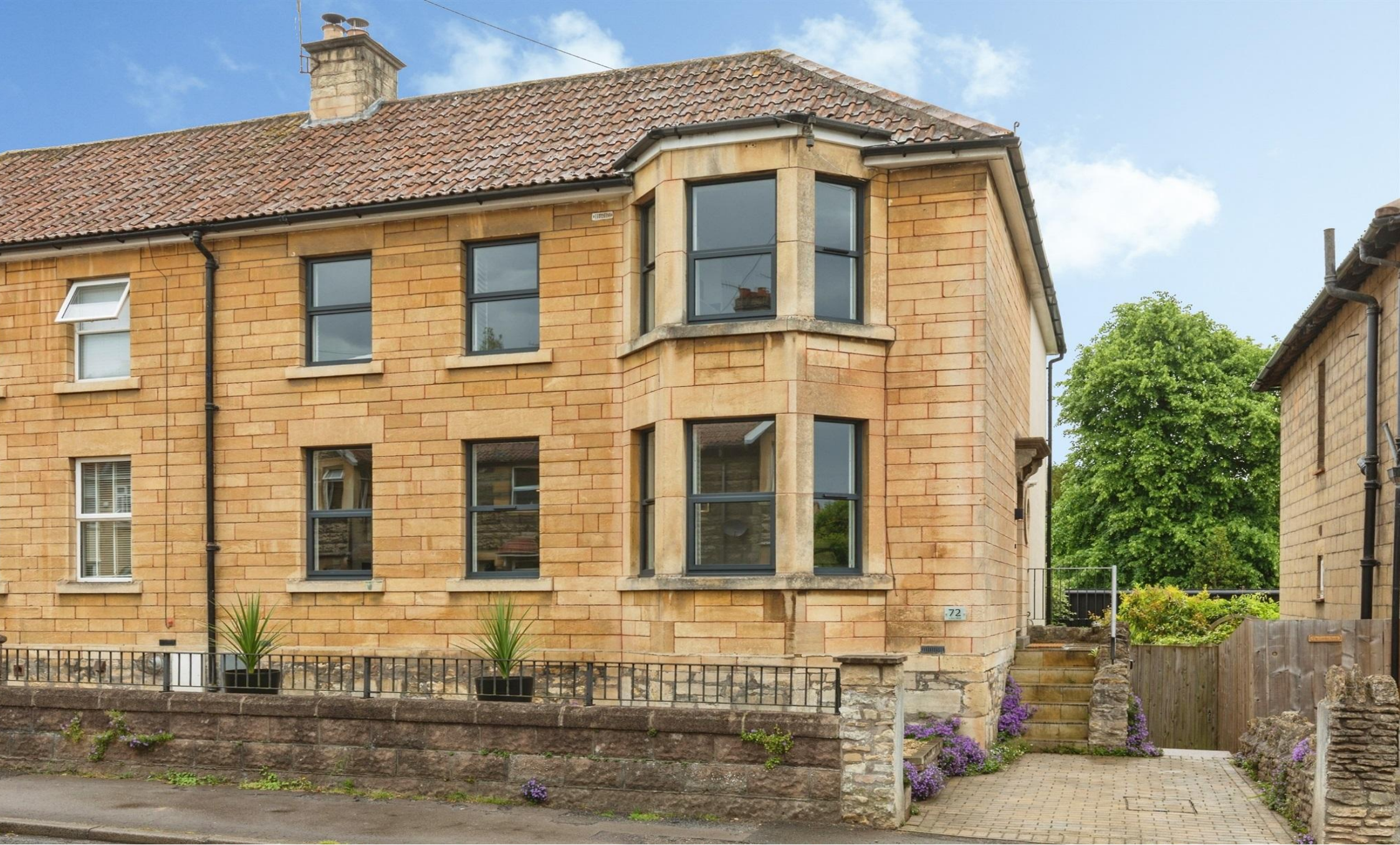
St. Johns Road, Bathwick Bath BA2 6PT