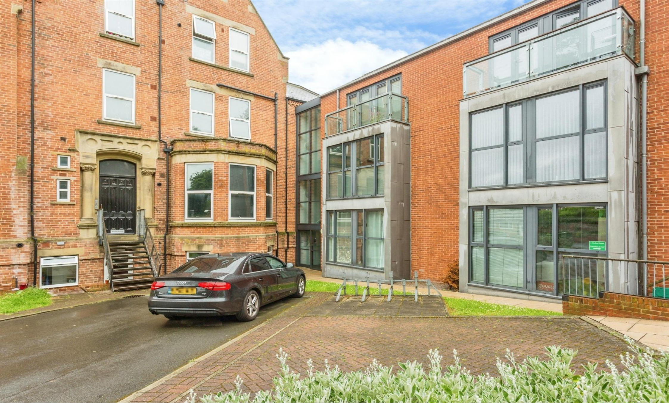
Linden House Manygates Park, WAKEFIELD WF1 5AR