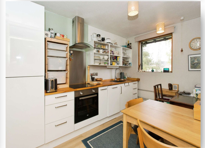
5 Ely Place Monkswell, Trumpington, Cambridge, CB2 9SS