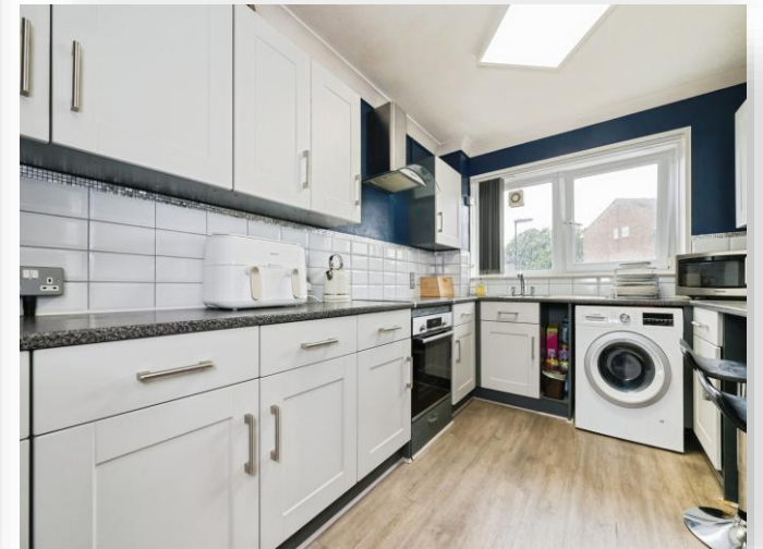
Wadhurst Gardens, Southampton SO19 9QR