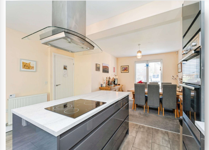
Stephenson Close, West Raynham, Fakenham, NR21 7DH