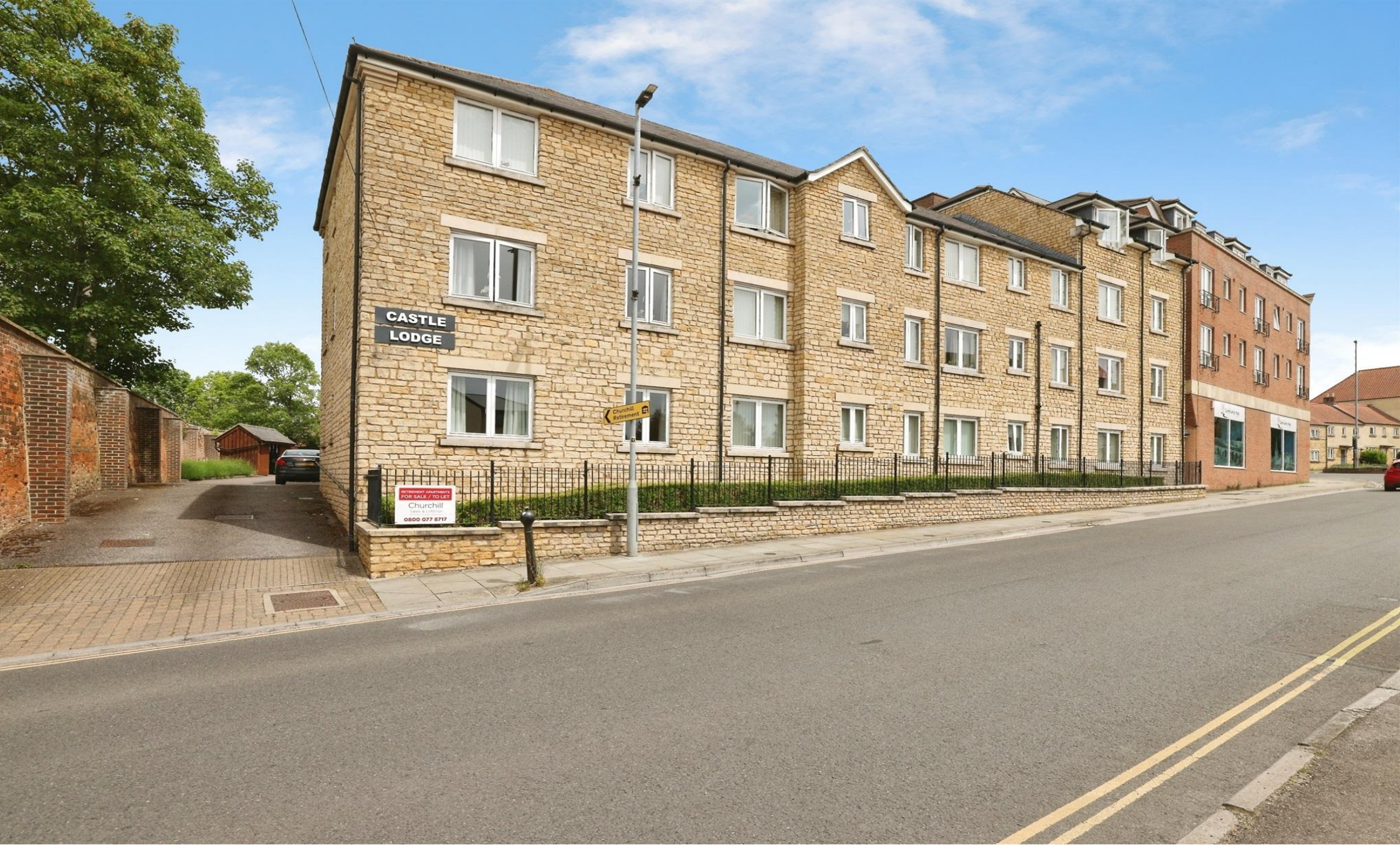
Castle Lodge Gladstone Road, Chippenham SN15 3YY