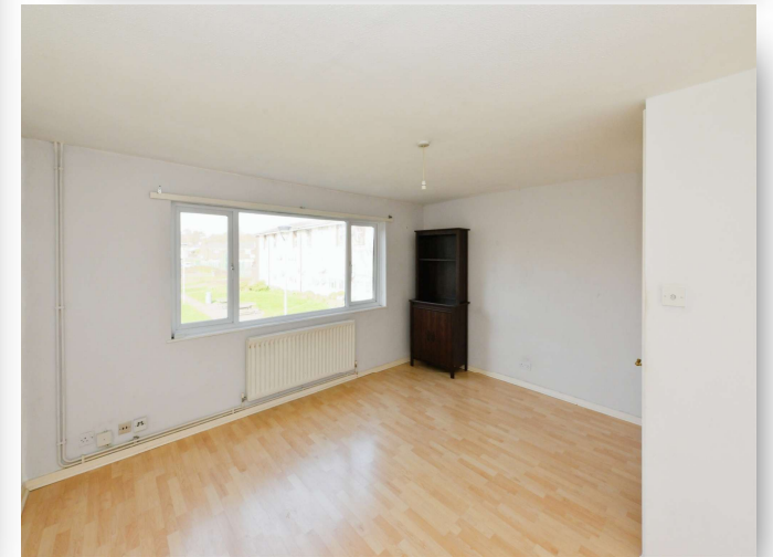
Macers Court, Broxbourne EN10 6EB