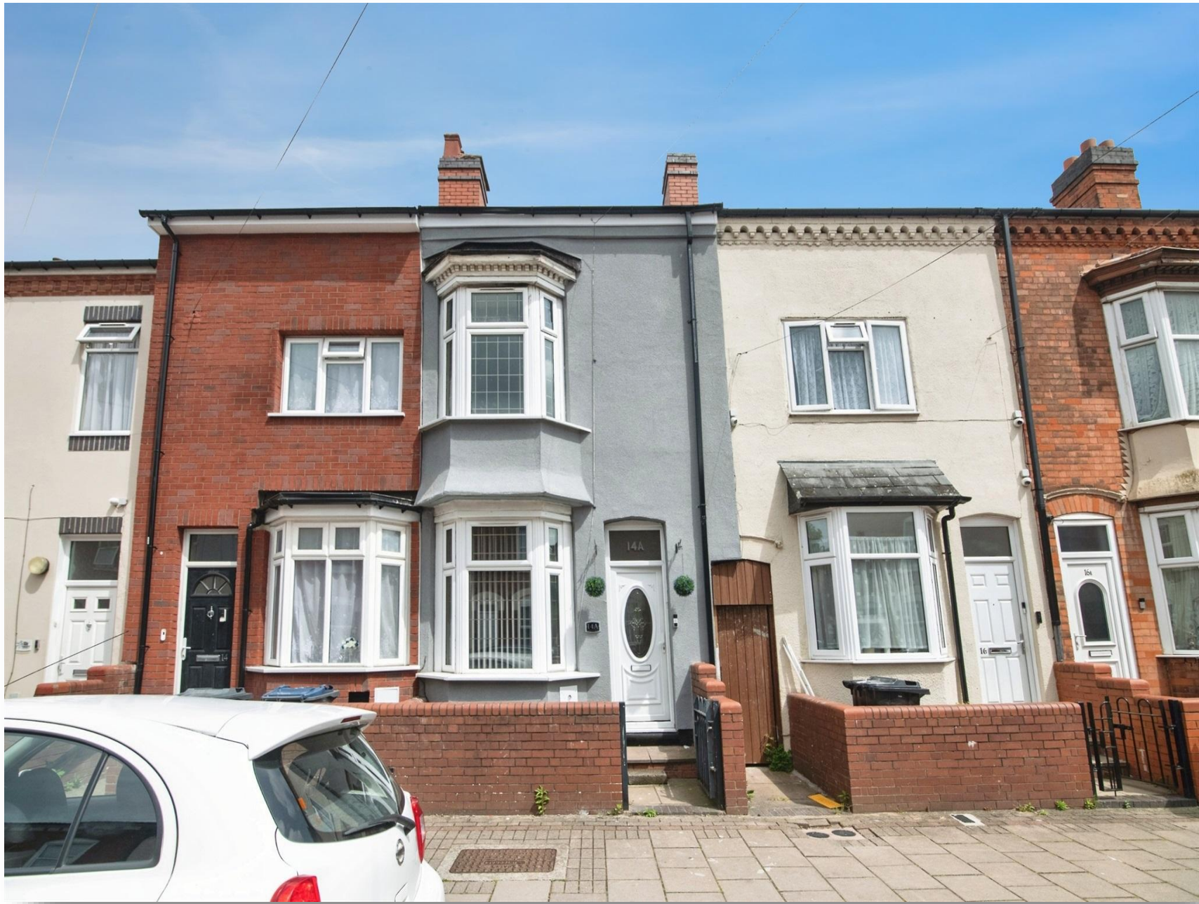
Carpenters Road, Birmingham B19 2BA