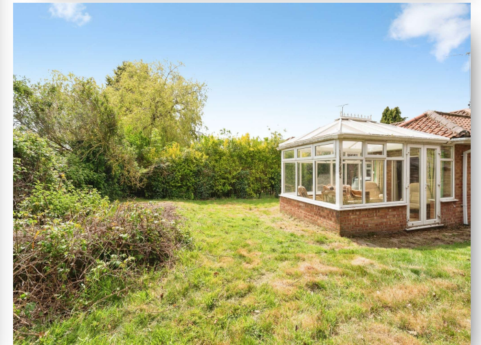
Groveside, East Rudham, King's Lynn PE31 8RL