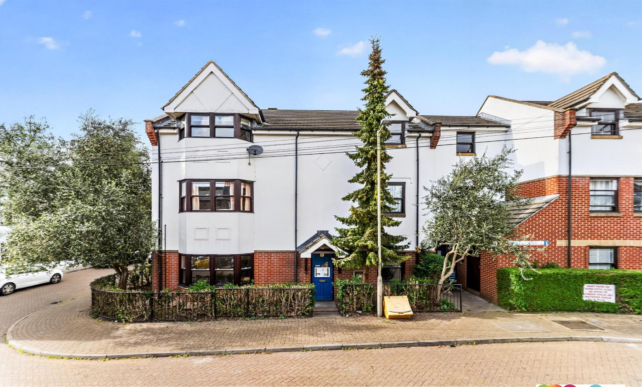
Flock Mill Place, London SW18 4QJ