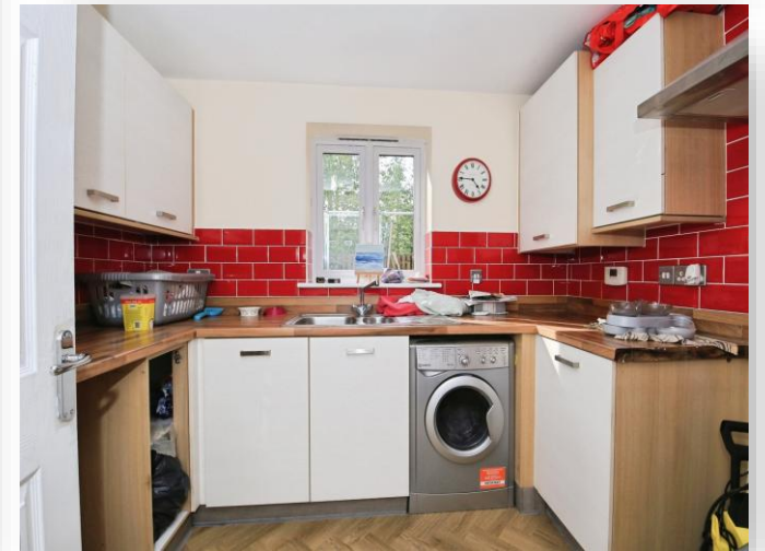
Magistrates Road, Hampton Vale Peterborough PE7 8EQ