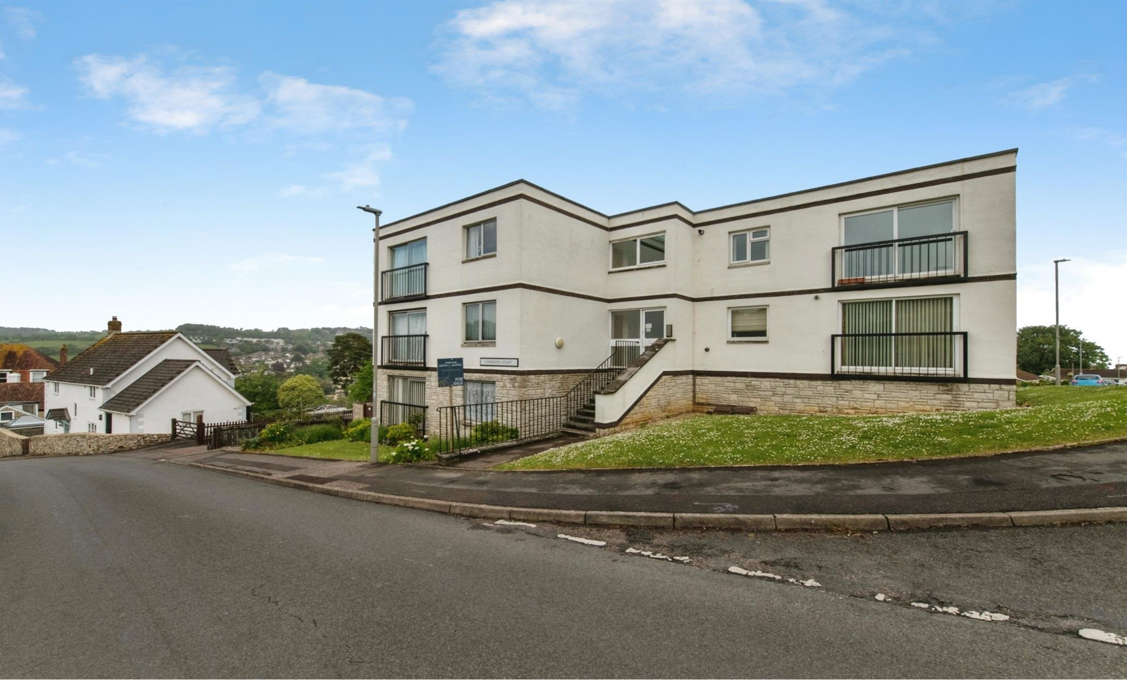
Chideock Court Clappentail Lane, Lyme Regis DT7 3NW