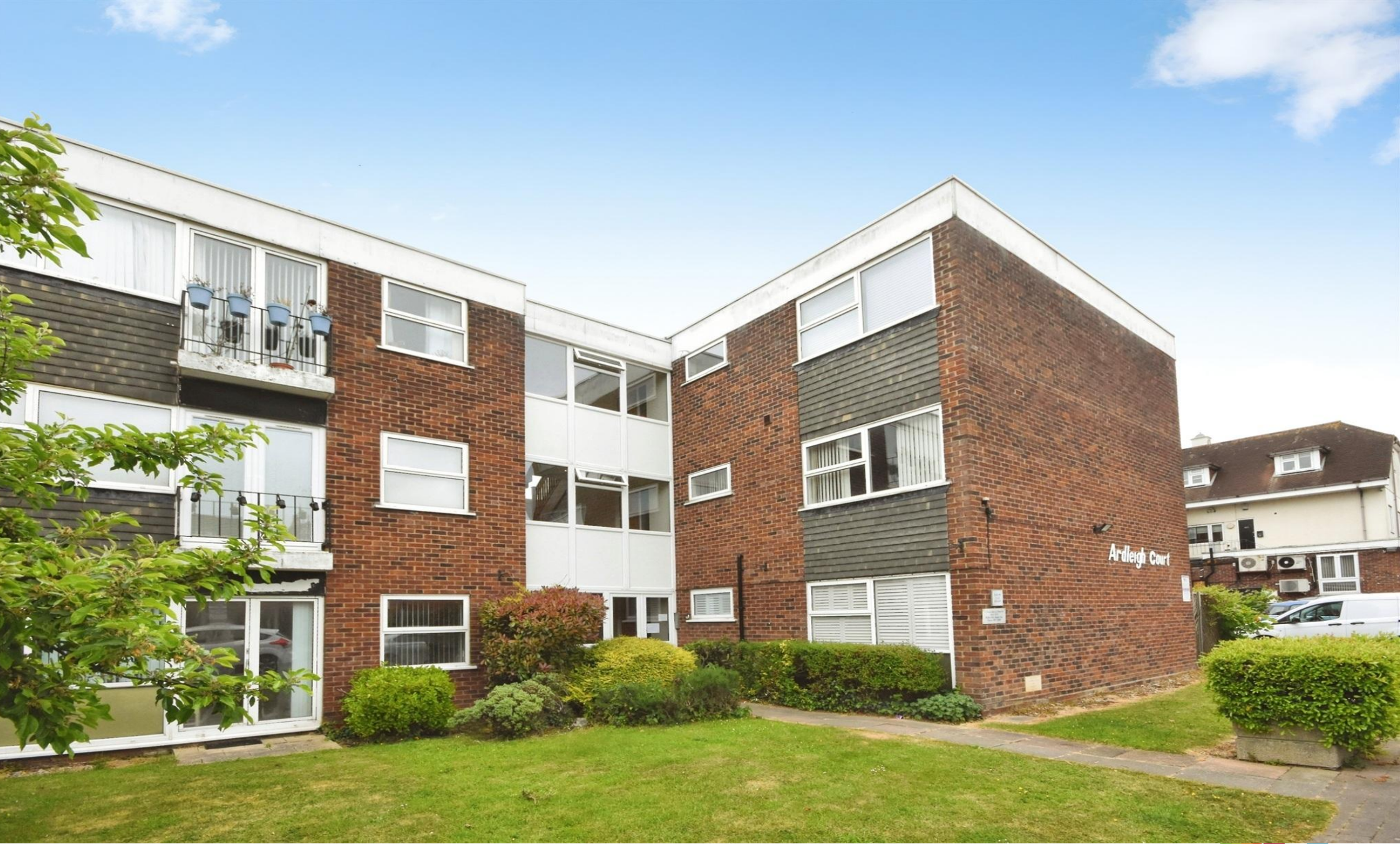
Ardleigh Court, Hutton Road, Shenfield, Brentwood, CM15 8LZ