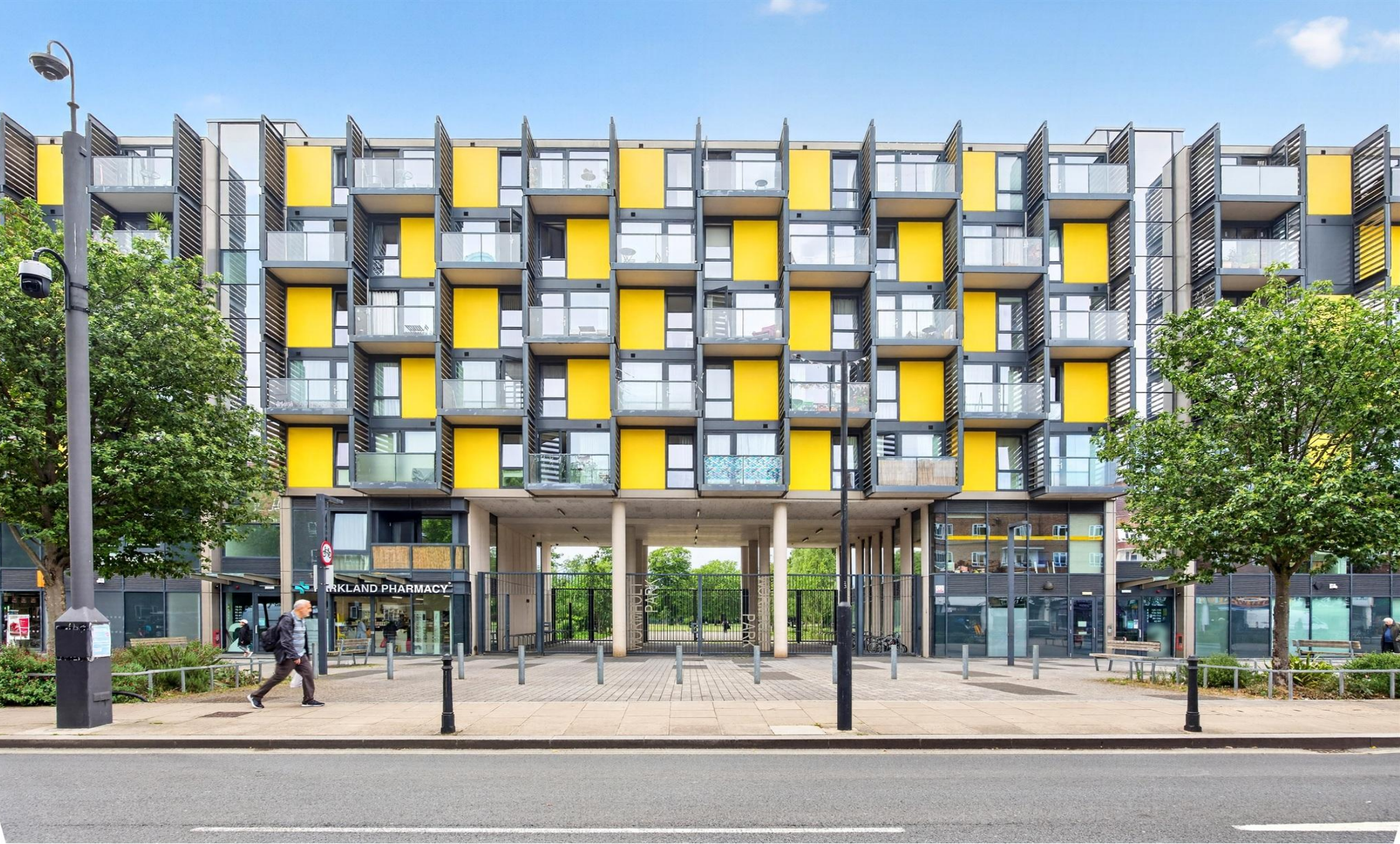
Cranston Court, Bloemfontein Road, London, W12 7FF