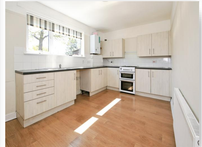
Luddington Road, Peterborough PE4 6HH