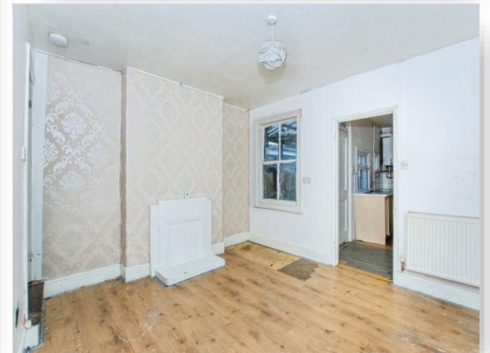
Cannon Street, Wisbech PE13 2QW