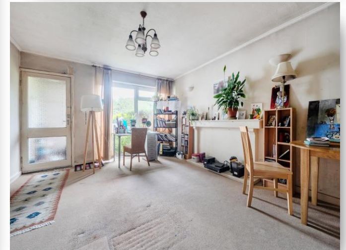
3 Addison Court, Ray Park Avenue, Maidenhead SL6 8EF