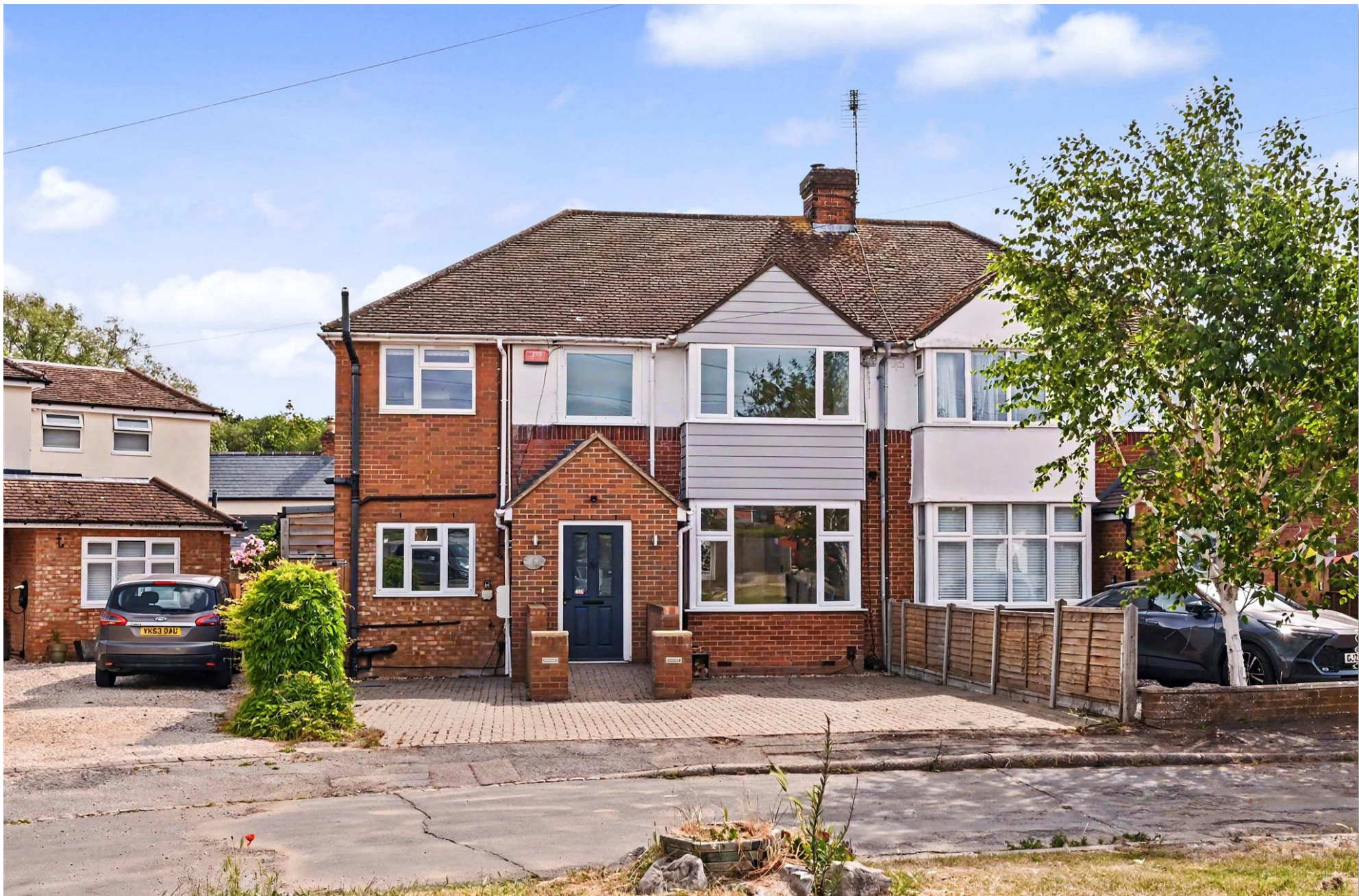
Stanhope Close, Wendover Aylesbury HP22 6AH