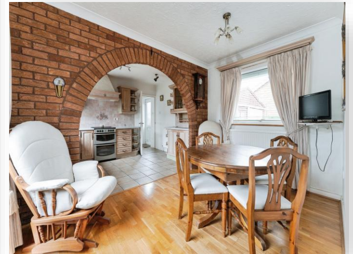
Creek Road, March PE15 8RY