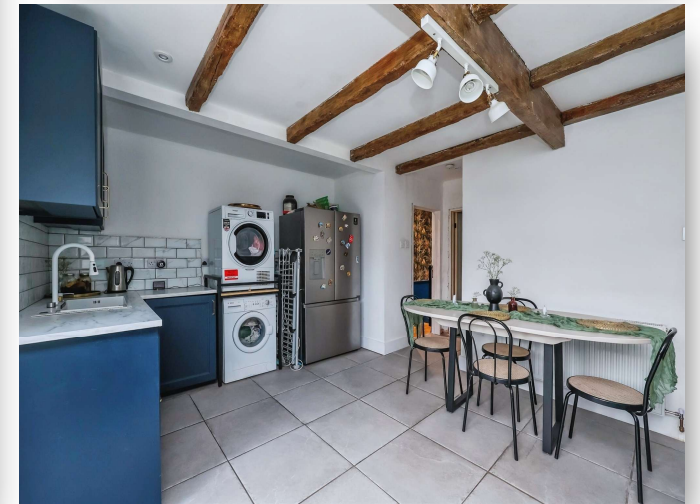
Critchs Flats, Kimberley Nottingham NG16 2JT