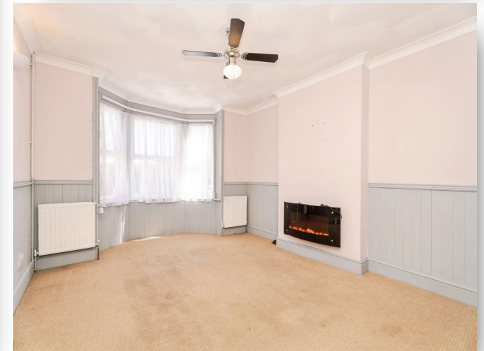
Queens Road, FAKENHAM, NR21 8BU