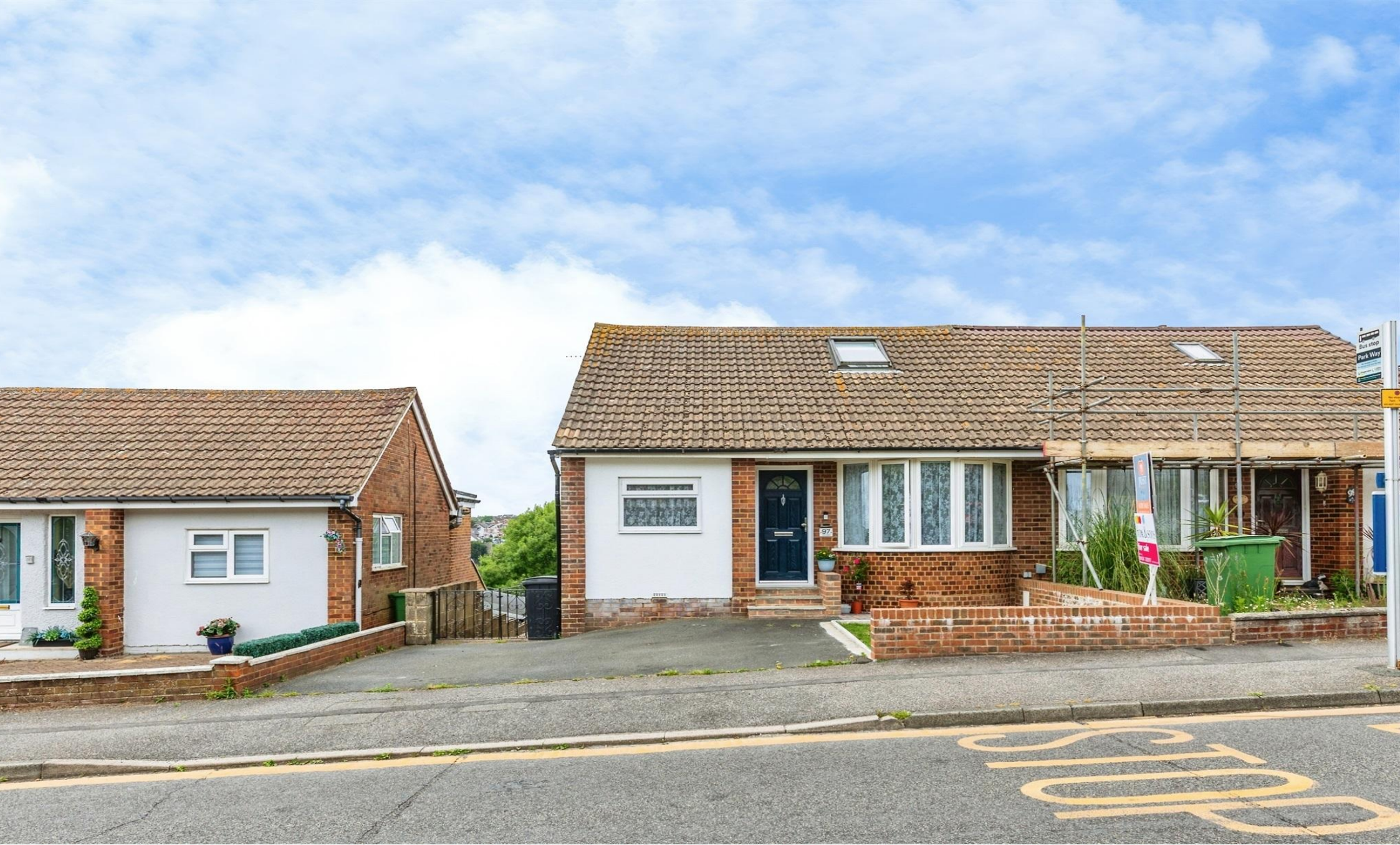
Park View, Hastings TN34 2PD