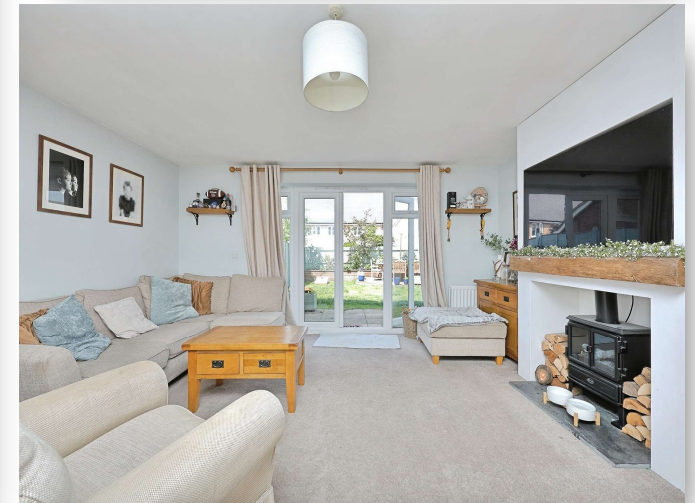
Peregrine Grove, Wymondham NR18 9FH