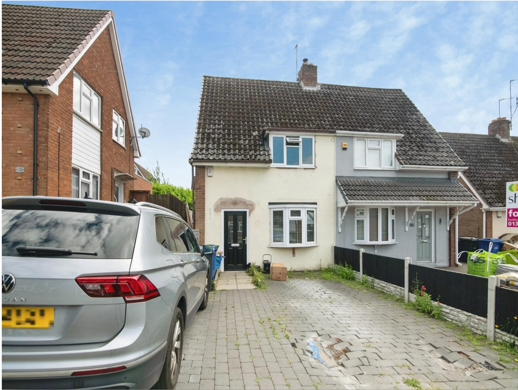
Corbyn Road, Dudley DY1 2JY