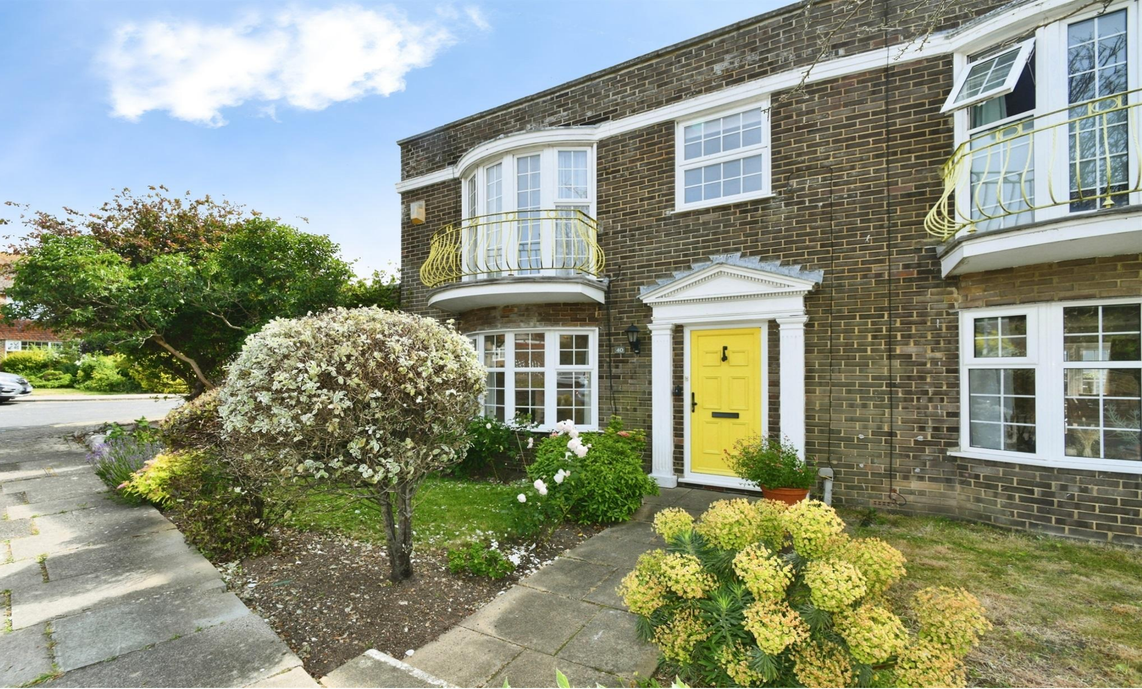
Prince Regents Close, Brighton, BN2 5JP