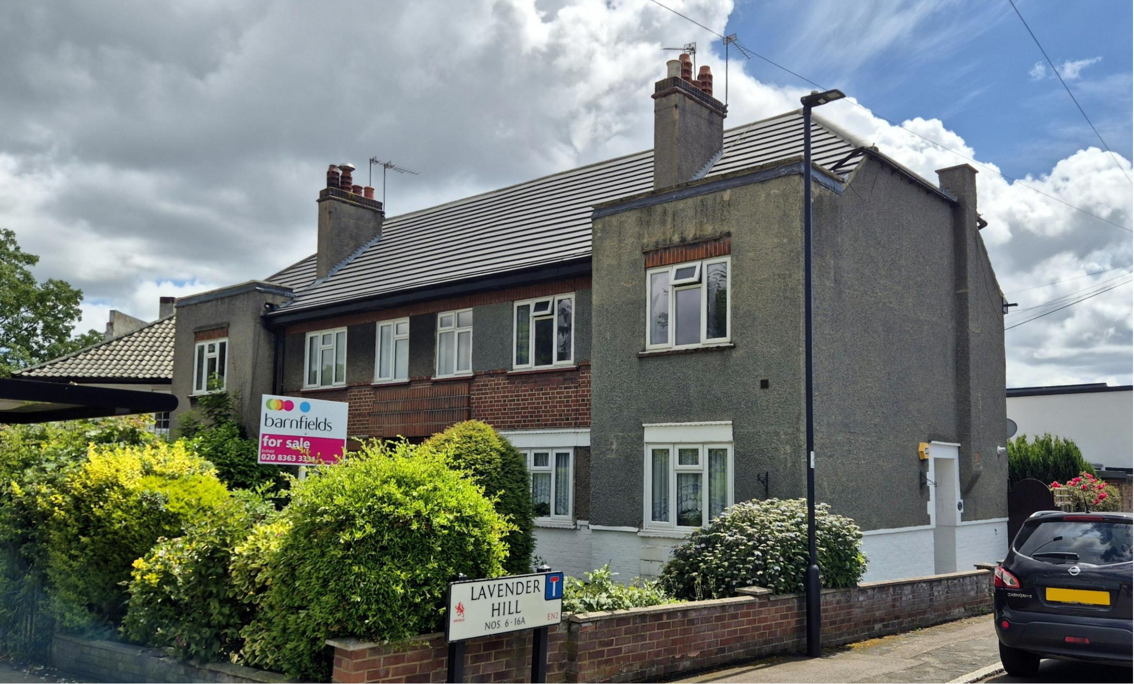
Lavender Hill, Enfield, EN2 0RE