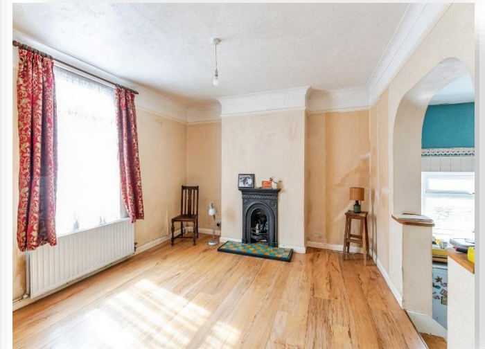
Bridge Street, Raunds NN9 6HZ