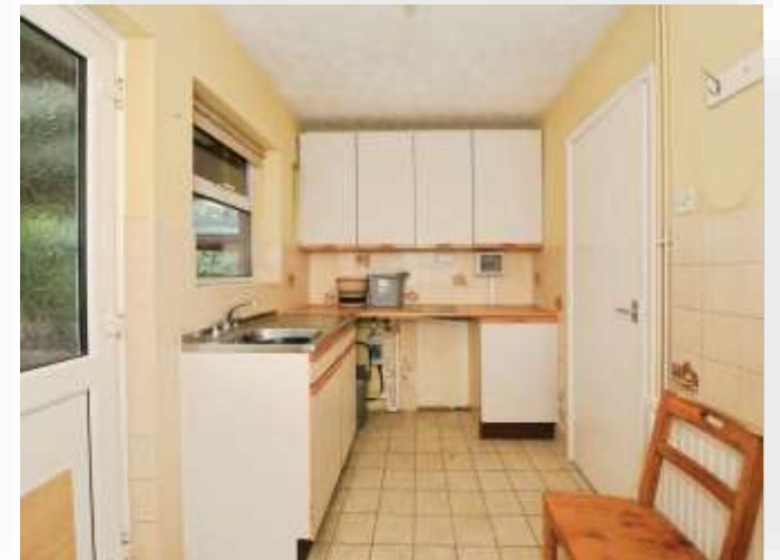
Church Close, Stilton Peterborough PE7 3RG