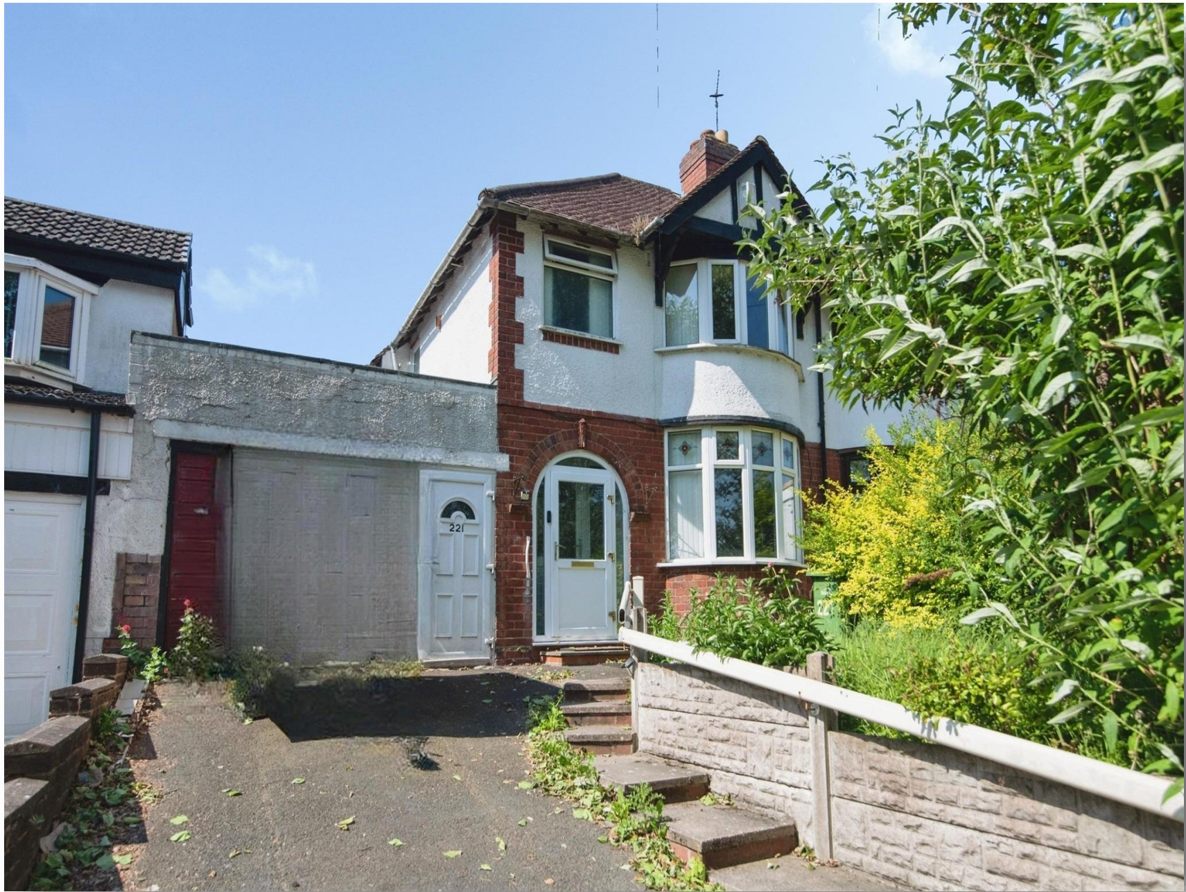
The Broadway, Dudley DY1 3EH