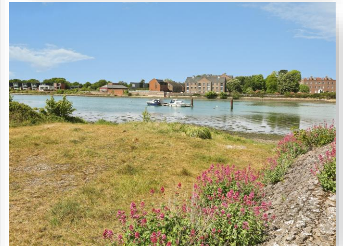
The Bridgehouse Weevil Lane, Gosport PO12 1GZ