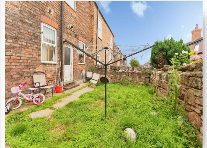
Marlborough Grove, Prenton, CH43 5RJ