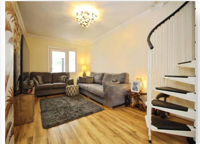
Wesley Croft, Leeds LS11 8RW