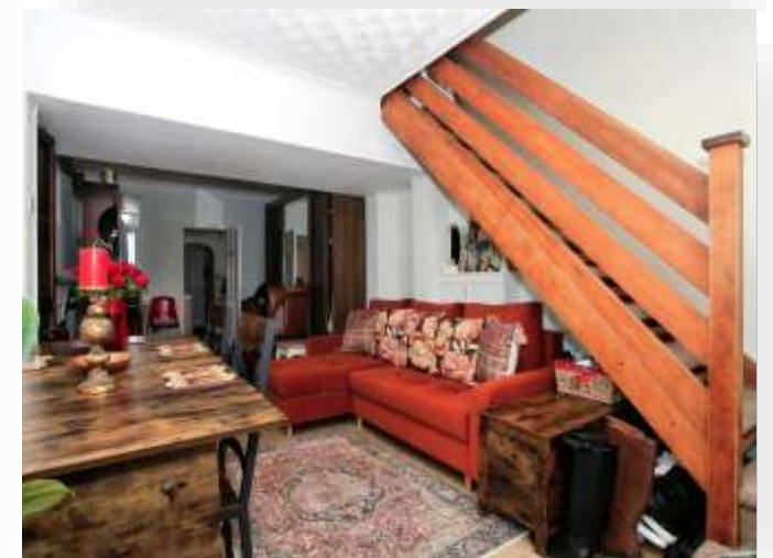
St. Margarets Place, Peterborough PE2 9EB