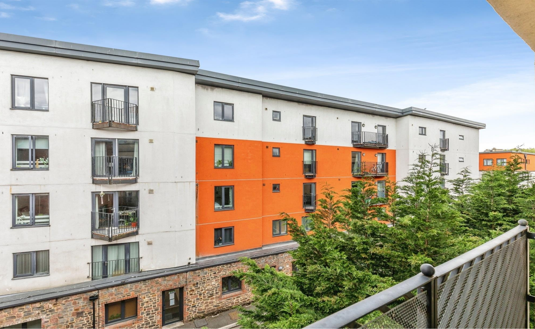
Midland Mews Waterloo Road, Bristol BS2 0PL